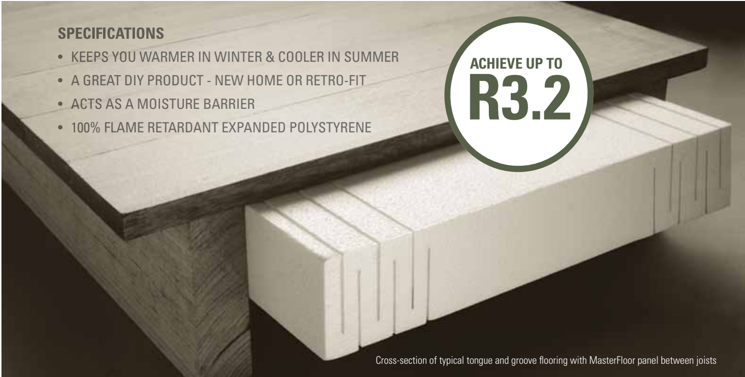
Cross-section of typical tongue and groove flooring with MasterFloor panel between joists